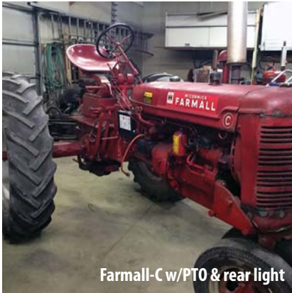
Farmall-C w/PTO & rear light