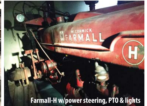
Farmall-H w/power steering, PTO & lights