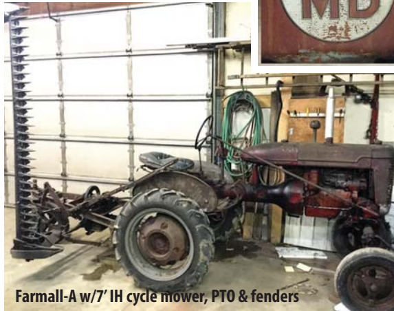
Farmall-A w/7' IH cycle mower, PTO & fenders