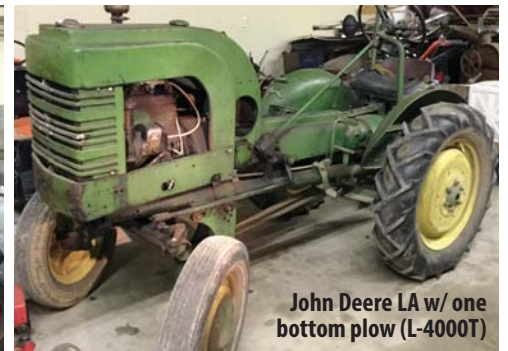
John Deere LA w/ one bottom plow (L-4000T)