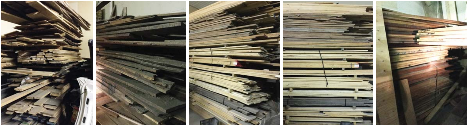
LUMBER: 20 Bunks of Lumber, Approx. 15,000 Board Feet—Oak, Maple, Cherry, Hickory, Quarter Saw White Oak, Red Oak, Reclaimed Barn Wood, and more .

Selling on site at: 12980 Arnold Rd, Dalton, OH 44618