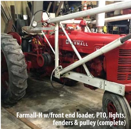
Farmall-H w/front end loader, PTO, lights, fenders & pulley (complete)