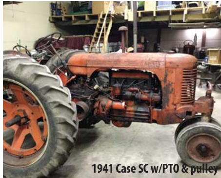
1941 Case SC w/PTO & pulley