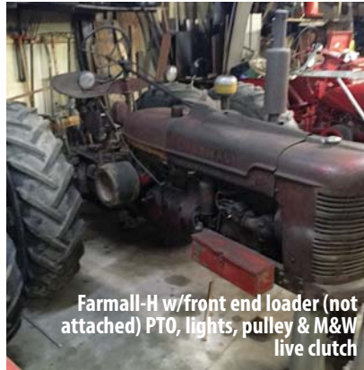
Farmall-H w/front end loader (not attached) PTO, lights, pulley & M&W live clutch