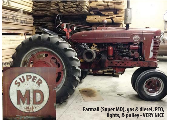
Farmall (Super MD), gas & diesel, PTO, lights, & pulley - VERY NICE